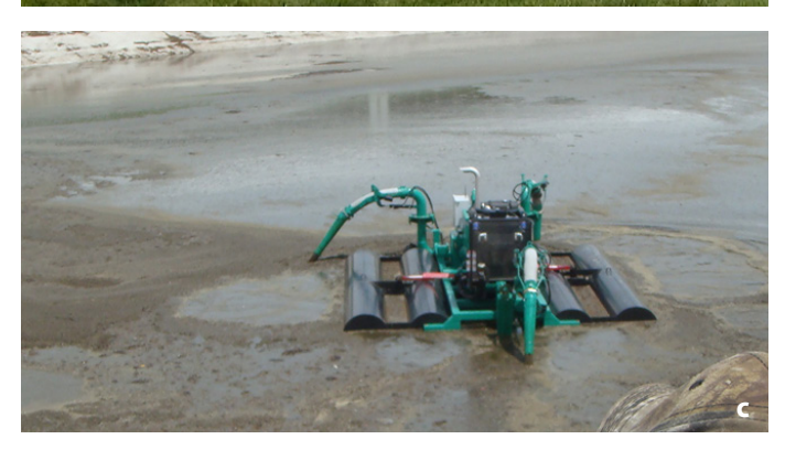
Figure 2. Types of agitators: a) pump, b) propeller, and c) boat.

agitation are either driven by tractor power takeoff (PTO) or remotely controlled boats (Figure 2).