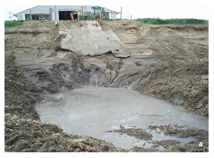
Figure 3. Erosion of an earthen manure storage.

Tractor-driven systems include high-capacity pumps, inclined shaft propeller-type agitators, inclined-shaft centrifugal agitators and chopper-agitator pumps. To be effective, these tractor-driven agitation devices should be able to move manure in the center and edges of the manure storage well enough to suspend the solids that concentrate in these areas. It is recommended to operate the agitation equipment every 100 feet, which is the average reaching distance for this type of equipment (Fulhage and Pfost 2000).