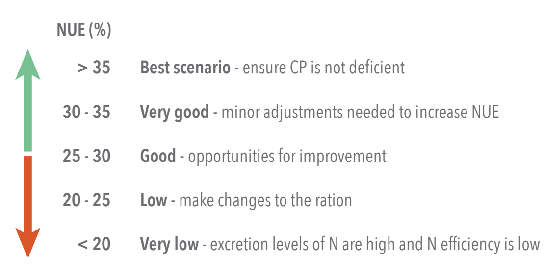
Figure 3. Interpretation of nitrogen use efficiency (NUE) values (adapted from Chase 2007).

urea N by 15% when CP constitutes 13-19% of the dry matter intake (Wattiaux and Ranathunga 2016). The challenge for dairy farmers and dietary consultants is to minimize CP content in the diet without sacrificing milk yield. Values for NUE in commercial dairy farms generally range from 20-35%, where maximum reported values can reach 40-45% (Chase 2011). Many factors affect NUE, with feed ration CP content