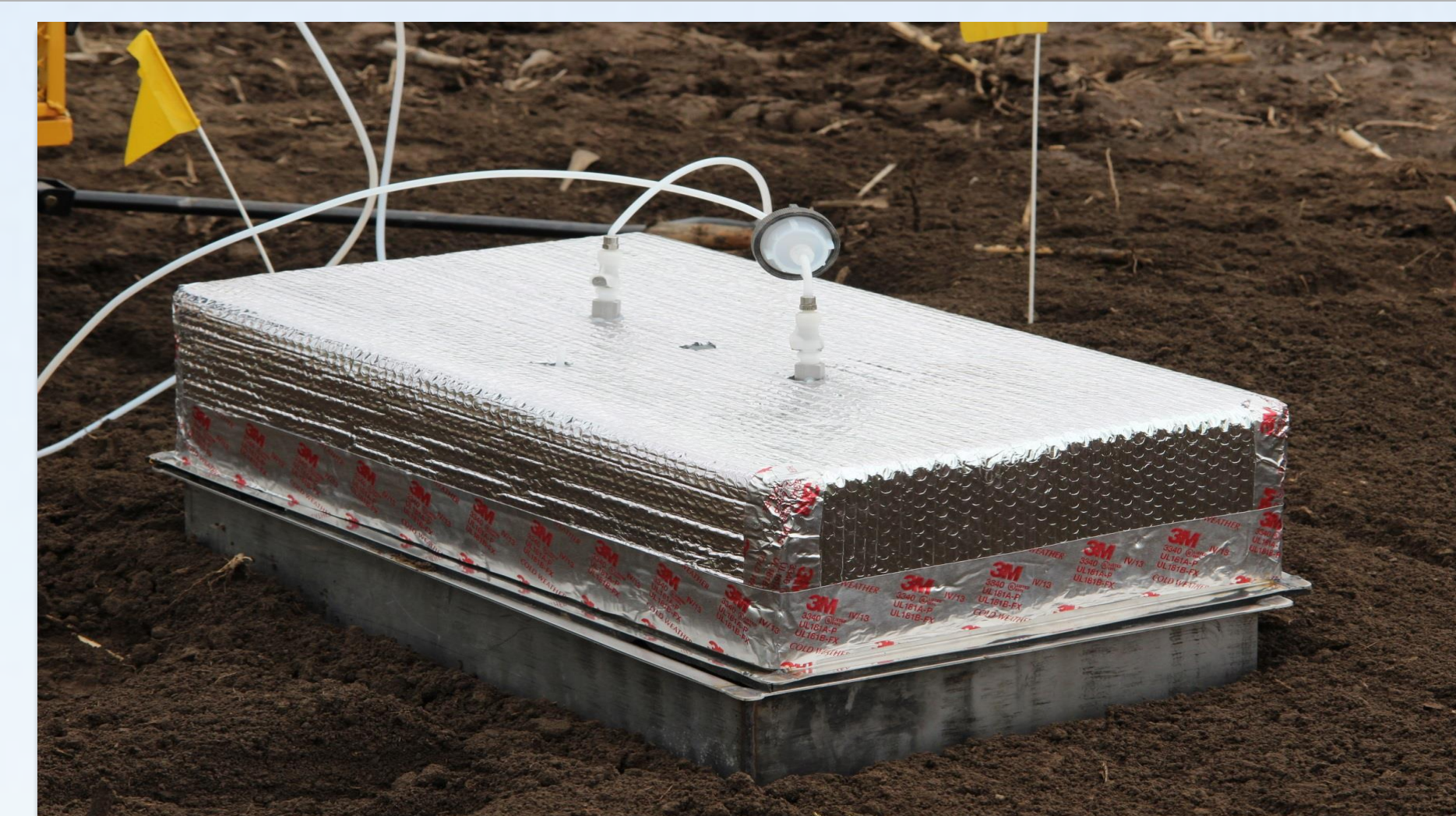
Figure 1. Greenhouse gas chambers, constructed of stainless steel, were used consistently at all sites. Chamber anchors were deployed at least 24 hours in advance of measurements. Chamber lids for this experiment were outfitted with a rubber gas sampling septa for syringe based sampling and two Teflon tubing fittings for FTIR tubing to attach to the chamber.

Two sampling strategies were used to determine a comparison of concentration and flux. For concentration measurements, the FTIR was run continuously for 20 minutes, with GC syringe samples taken from the chamber headspace every 5 minutes. For flux comparison samples taken every 10 minutes for GC samples (Table 1), and only for the first seven minutes of chamber deployment of each chamber lid.